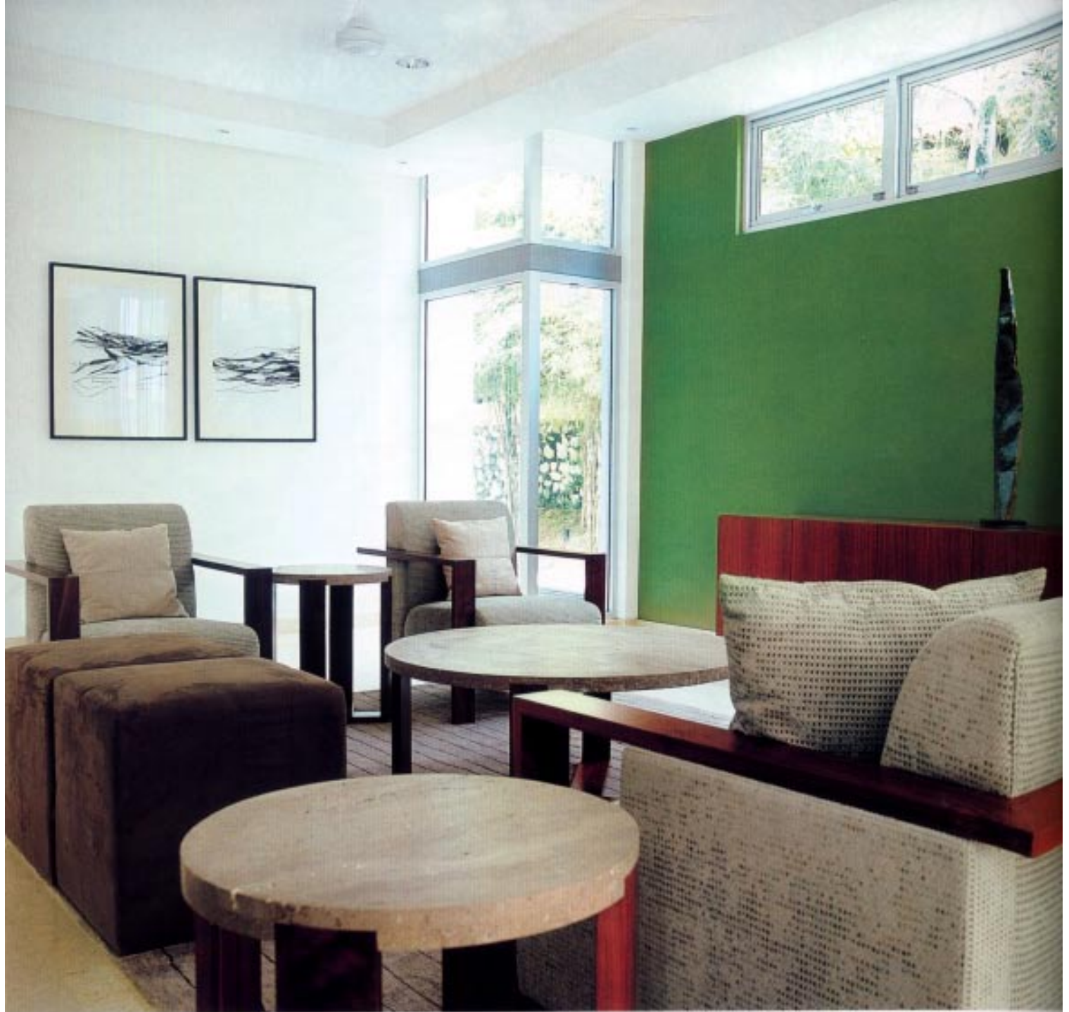
ABOVE Comfort wood.