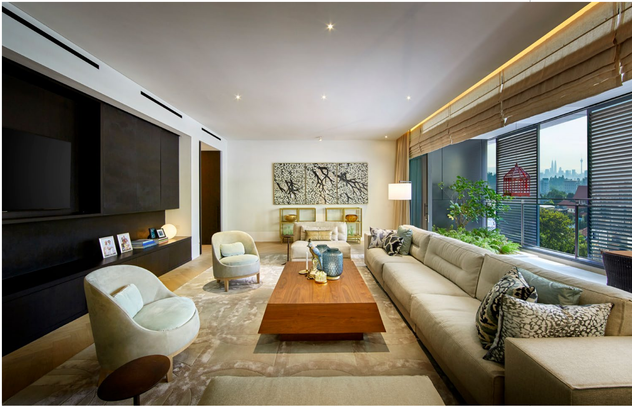
Show Apartment - interior view