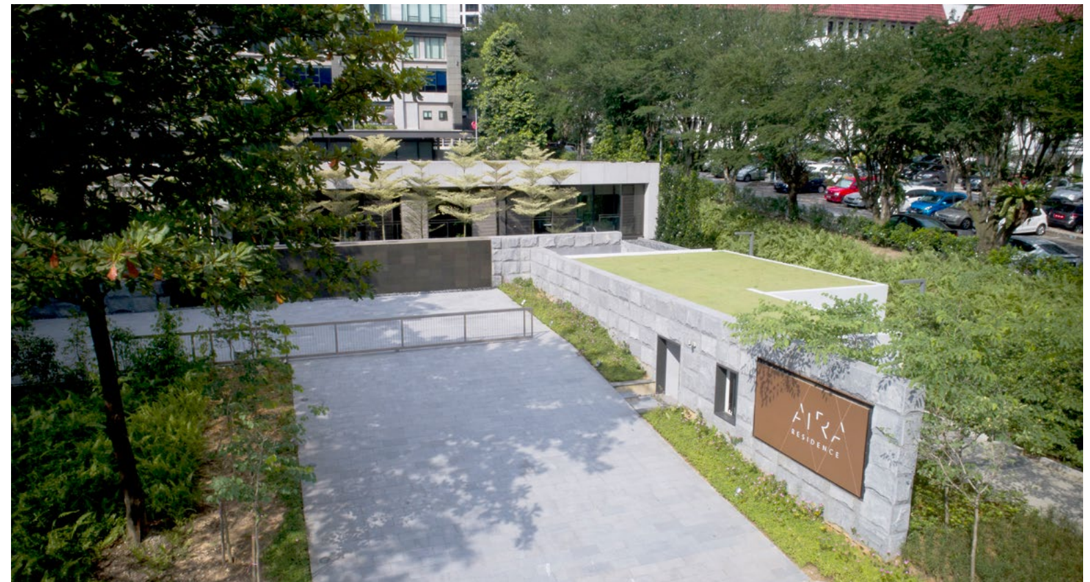
Sales Gallery entrance

“The design was thoughtfully done to heighten human senses of visual, sound, smell and touch by focusing on elements of materials, texture, and shape giving it a dynamic sense of expansion.”