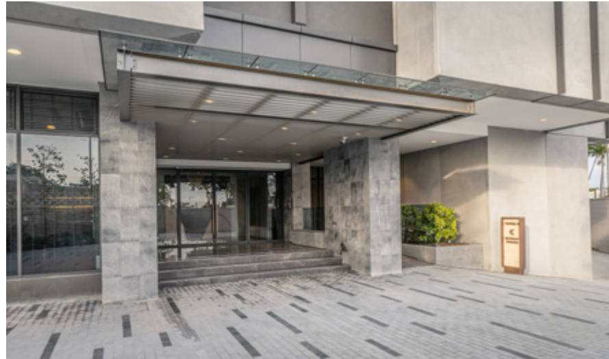
New disabled-friendly main drop-off shaded by a sleek glass roof

Upon entering from the new Main Entrance, visitors will be greeted by an expansive drop-off area, adorned with meticulously crafted multi-toned granite stone pavement. The vibrant greens, thoughtfully positioned along the edge, enhance the space's organic appeal. The disabled-friendly entrance, artfully shaded by a sleek glass roof, beckons visitors to indulge in the site's modernity and accessibility.