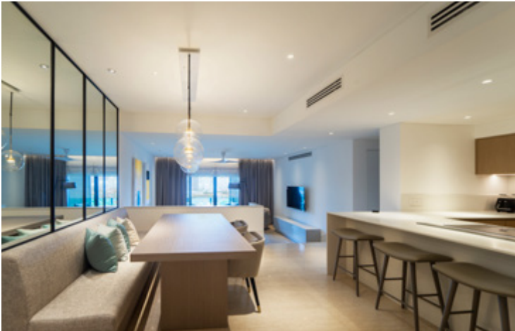
Apartment unit upgraded with new finishes and selected furnishing

The units have received an upgrade, featuring new finishes and partial furnishings, including complete kitchens and wardrobes. The upgraded units have been extended and redesigned, with larger master baths and improved balconies with sliding shutters. These enhancements improve the units' overall functionality and aesthetic appeal.