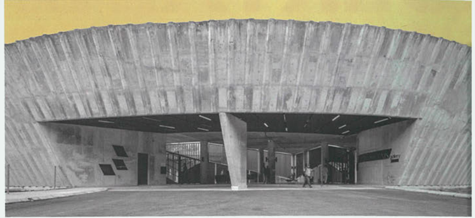
Azman Hashim Gallery by GDP Architects in collaboration with KEAN Architect

MAGAZINE OF THE MALAYSIAN INSTITUTE OF ARCHITECTS