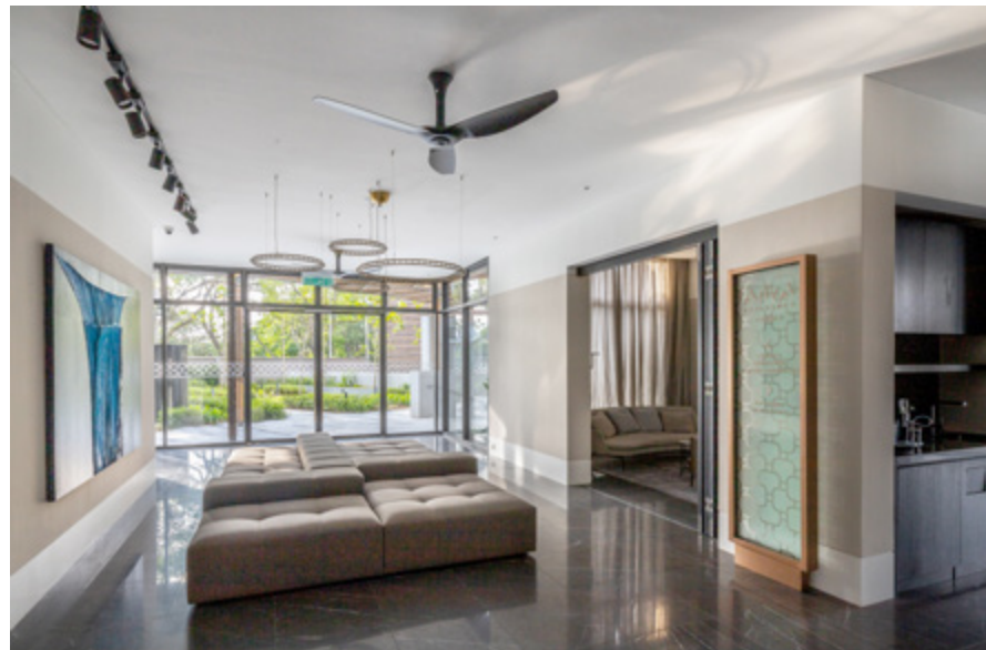
New Main Lobby, a vibrant hub that seamlessly connects visitors to the indoor and outdoor spaces

The original lobby was dim and cluttered, underutilized. To create more communal space, Tower B's ground level has been reimagined with a lounge, meeting place, and sitting areas. The new lobby is now a vibrant hub, seamlessly connecting visitors to various indoor and outdoor spaces, aligned with the modern aesthetic of the development.